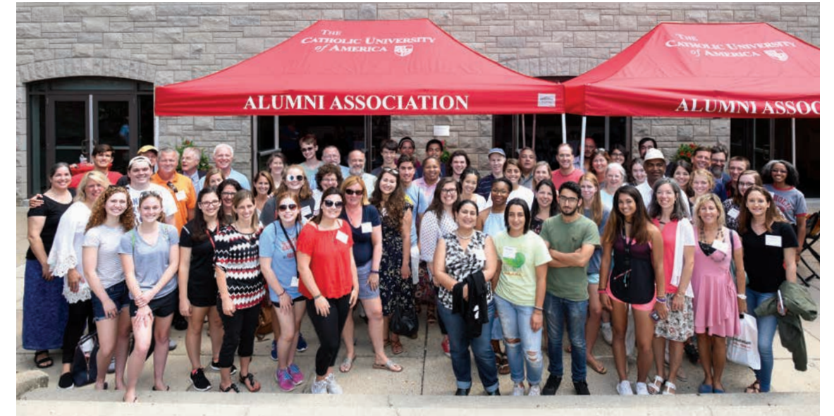
During Orientation in August, alumni parents and their Class of 2021 children gathered to mark the milestone with a photo in front of the Craves Family Alumni Center.