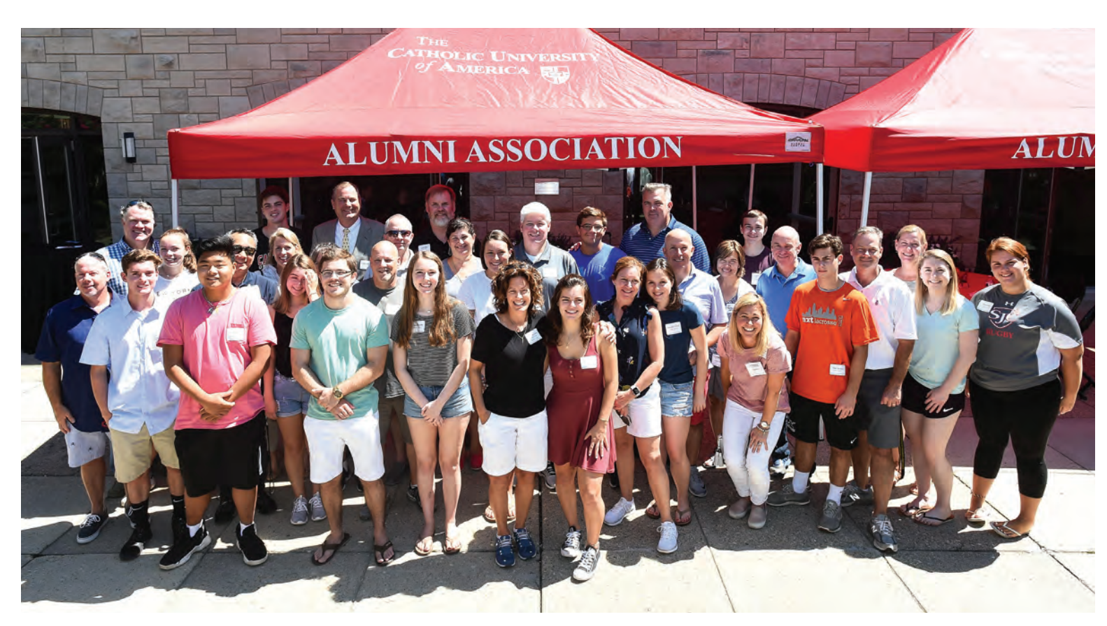
In August, the Alumni Association recognized a group of alumni parents and the children who have followed in their footsteps to Catholic University. During a special lunch, the University welcomed the new students and greeted their parents as they returned to campus.

the second-largest suburban office market in the nation — and one with 10 Fortune 500 headquarters and top companies in a broad set of industry sectors. In retirement he will serve as a fellow at the College of Charleston, consult with institutions in northern Virginia, and serve on a local board.